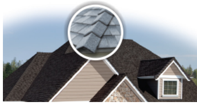
UltraHP® High Profile Shingles